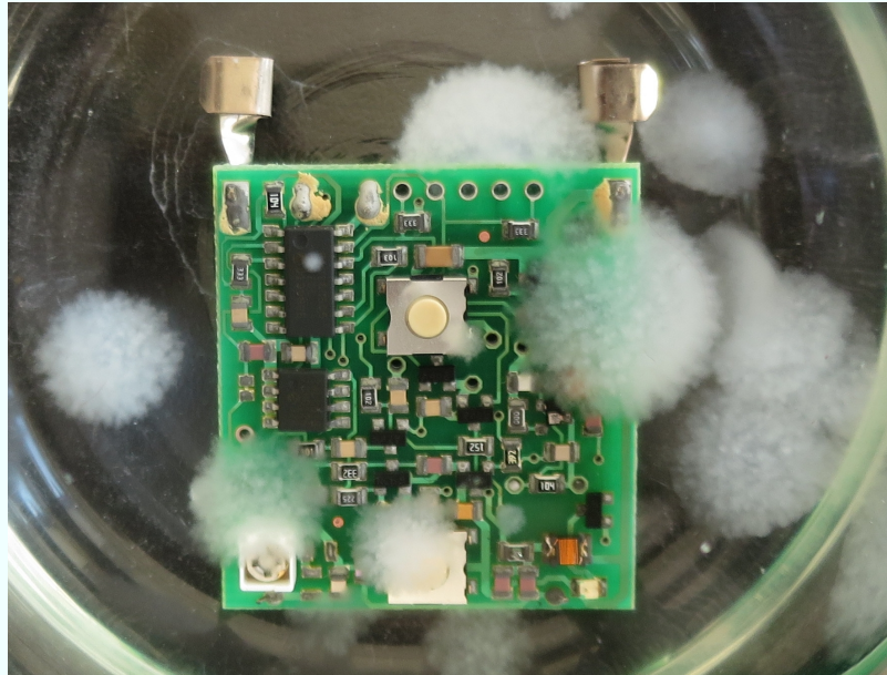
Figure 1: Chip colonized by microbes.